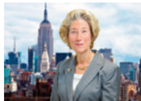
Judge Shira Scheindlin Ex US Federal Judge, SDNY