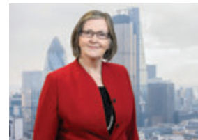
Fidelma Macken SC Ex Court of Justice of the European Union and Irish Supreme Court